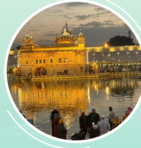
GOLDEN TEMPLE AMRITSAR