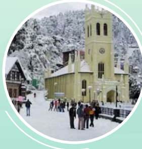
QUEEN OF HILLS SHIMLA