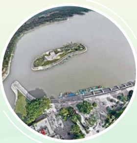
SUKHNA LAKE CHANDIGARH