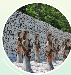
ROCK GARDEN CHANDIGARH