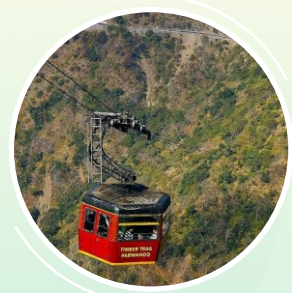
TIMBER TRAIL, CHANDIGARH