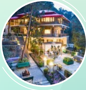
KASAULI, HIMACHAL PRADESH