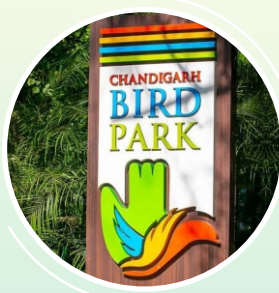
BIRD PARK, CHANDIGARH